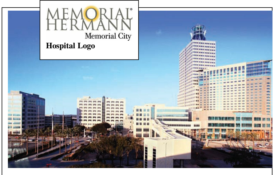
MEMORIAL HERMANN Memorial City Hospital Logo